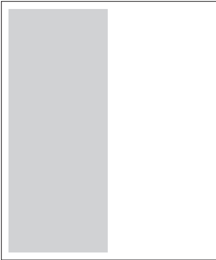
Half Page (vertical)